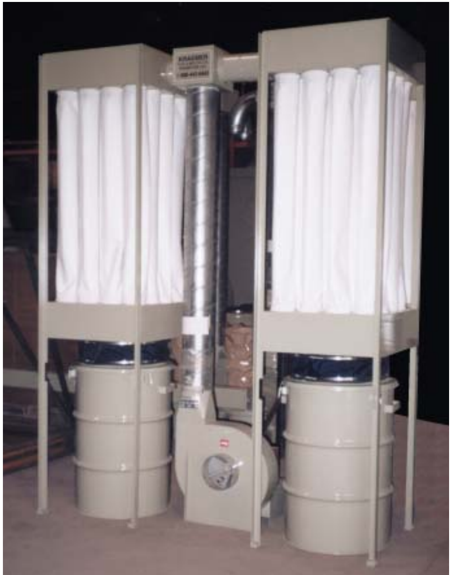
KTM EP 5-32 Dust Collector